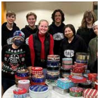
High school youth organized a "Sweets for Sharing" event in December. Over 450 treats were made and delivered to homebound Nativity members.