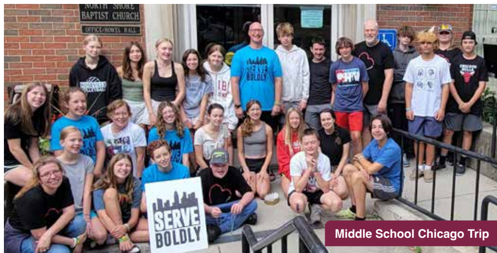
Middle School Chicago Trip