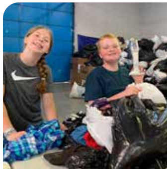
Middle School youth sorted clothing donations to be distributed to people in need.

A Note for Summer 2024: The ELCA Youth Gathering is in New Orleans, July 16-20, 2024, and Nativity will be there! Held every three years, the gathering is a national convention of the ELCA in America for high school youth focusing on forms of service. Look for more details to come about the Gathering and about the middle school service and learning trip.