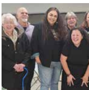
LIFELONG GROWTH Page 3