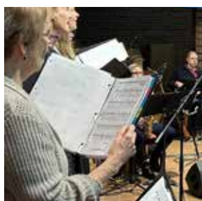
FAITH COMMUNITY Page 2