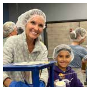
SERVICE AND OUTREACH Pages 6-7