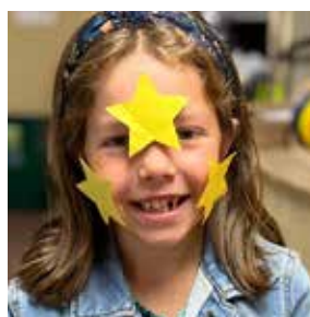
CHILDREN AND FAMILIES Pages 4-5