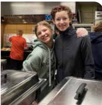
Nativity youth and their families served 900+ pancakes at their Palm Sunday Pancake Breakfast to raise money for their summer trips.